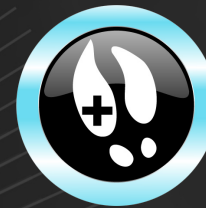
Herd Health Software

Cervid Solutions has engineered our cutting-edge Life Cycles Program with you, the member, in mind. The program we provide is in-depth, professionally developed and available as part of our Cervid Membership Program. It consists of three primary technologies.