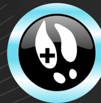
Herd Health Software

Cervid Solutions has engineered our cutting-edge Life Cycles Program with you, the member, in mind. The program we provide is in-depth, professionally developed and available as part of our Cervid Membership Program. It consists of three primary technologies.